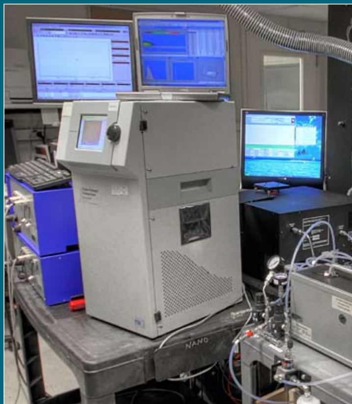
Particle generation system with the catalytic stripper technology